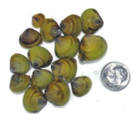
Asian Clam.

The Asian Clam: The Asian clam has been confirmed in the Merrimack River from the Town of Bow south through the Town of Merrimack since approximately 2010; in 2011, it was reported and confirmed in Cobbetts Pond in Windham, and in 2012, reported and confirmed in Long Pond in Pelham. Asian clams are round, yellow-green to dark brown shellfish with thick, concentric rings on their shells. They are typically small, averaging less than 1.5 inches in size, and prefer the shallow, relatively sun-lit, warmer areas of waterbodies with sand or gravel bottoms. Its ability to rapidly reproduce and physically attach to objects creates several problems, including altering the aquatic food web, clogging water intake pipes, and making recreation unpleasant by littering swimming areas with shells. Asian clams can also cause serious water quality problems-by feeding from the bottom sediment they can release phosphorus into the water, which in turn fuels plant and algal growth and increases the likelihood of potentially hazardous cyanobacteria blooms. An effective means to permanently eliminate Asian clam infestations has not yet been found; therefore, empha-